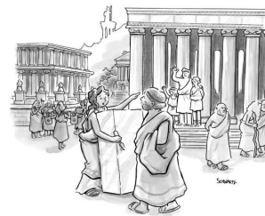
"Hey, would you mind taking a quick sculpture of me and my family?"

As we enter into Autumn, as we take the time to prepare for the winter months, please also take time to prayerfully consider how you can financially show your love for your parish family! Everyone is needed because everyone is a part of our family.